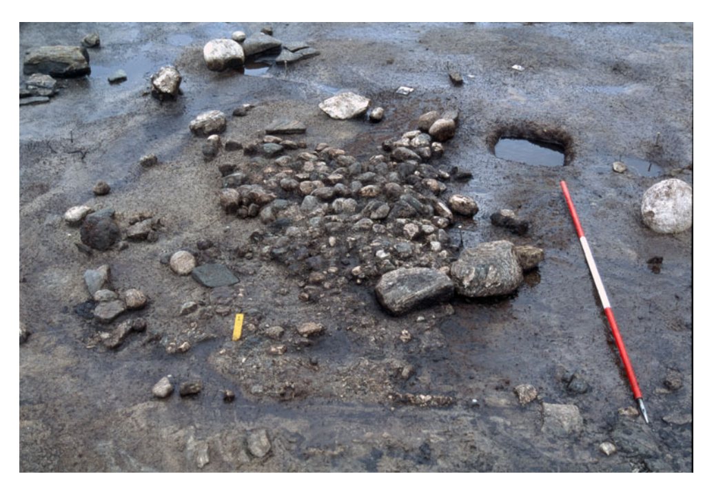
Figure 3. Unit G at Nyhamna 48: concentration of stones sorted by size inside a tent-ring.

concentrations measuring c. 1 m in diameter containing fire-cracked, red-burnt, fist-sized stones (Bang-Andersen, 2015: 85). These features appear to be located on the surface rather than in shallow depressions. Only a few were stone-lined. Some contained small fragments of charcoal consisting predominantly of birch and willow, although remains of oak and pine were also found (Bang-Andersen, 2006, 2015: 87).