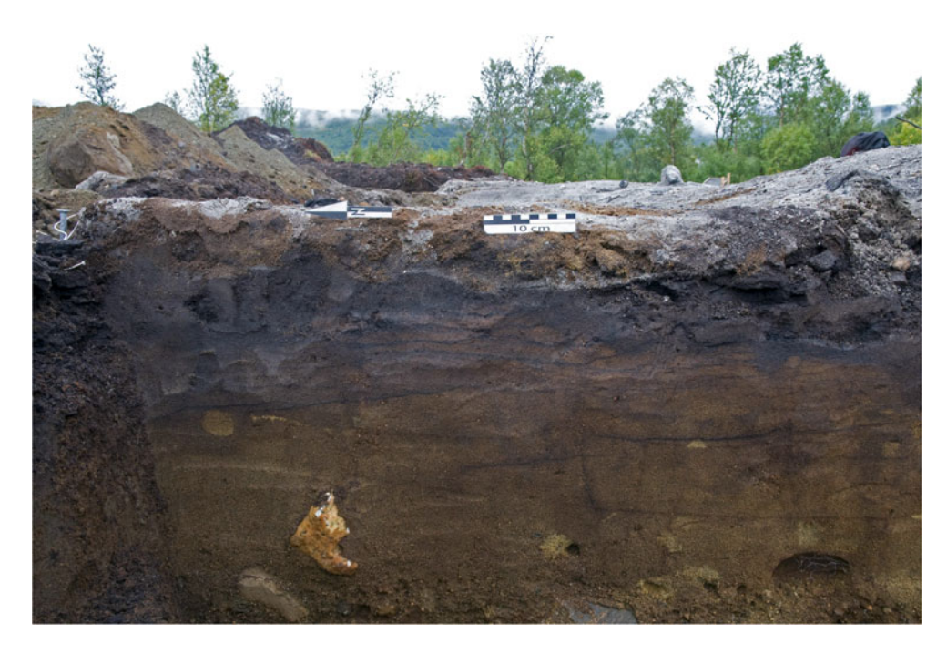
Figure 2. Successive thin charcoal lenses at Tønsnes 10 A15536, Troms, northern Norway.

(Skandfer, 2010: 140). It seems likely that this was a location for pyrotechnological activity rather than a refuse pit. At Mohalsen II (no. 15 on Figure 1 and Table S1) in the southernmost part of the northern region, two separate fireplaces were identified: they consisted of a concentration of potato-sized pebbles in one layer mixed with sooty soil and fragments of charcoal. A little under half of these were fire-cracked.