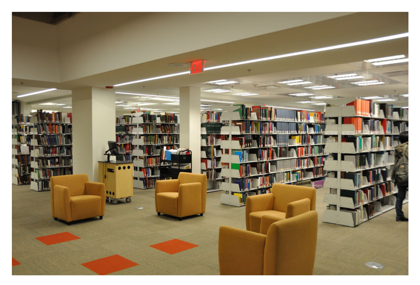
Soft seating area in the Osgoode Hall library

were changing, things were emerging. There were different databases coming up, and so I helped them to manage all the subscriptions, did the website and so many things; trained some of their staff as well. So, that was The Bahamas. And then by that time, it was time to move on to something else."