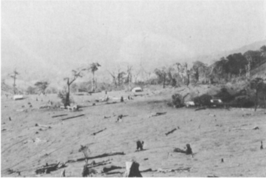
Rain forest destruction in the Lacandon Forest (A. Estrada).

a much slower rate than the disappearance of the rain forest. With the aim of having a permanent research site that could work as a beach-head for conservation and to provide the needed continuity in research, the Instituto de Biología created a research station, Los Tuxtlas, in 1967. Here long-term projects are under way to obtain a detailed knowledge of the species composition of the ecosystem, and to describe and understand ecosystem structure and function with the long-term objective of conserving it and using its resources rationally. Los Tuxtlas is in the eastern part of the range Sierra de Los Tuxtlas, an area of volcanic origin dominated by the San Martín Volcano. It covers 700 ha in which the dominant vegetation type is high evergreen rain forest (Miranda and Hernández, 1963). It consists of a strip of land, 5 km long and 1.5 km wide from north to south, connected to an area of about 10,000 ha of rain forest extending toward and around the San Martín Volcano. This latter area was designated as a reserve by the state government in 1980.