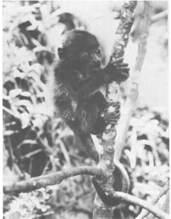
Infant howler monkey, about four weeks old, rescued from poachers who had killed the mother in the forests of Chiapas.

extends toward the San Martín Volcano. In the eastern section of the reserve a zone has been set aside for research projects and, at the eastern extremity, 6–8 ha of forest form an educational area with a small zoo containing representatives of the local fauna and with a system of trails with signs and labelled plants.