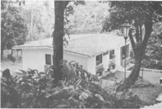
Facilities to house scientists and students at the biological reserve, Los Tuxtlas (A. Estrada).