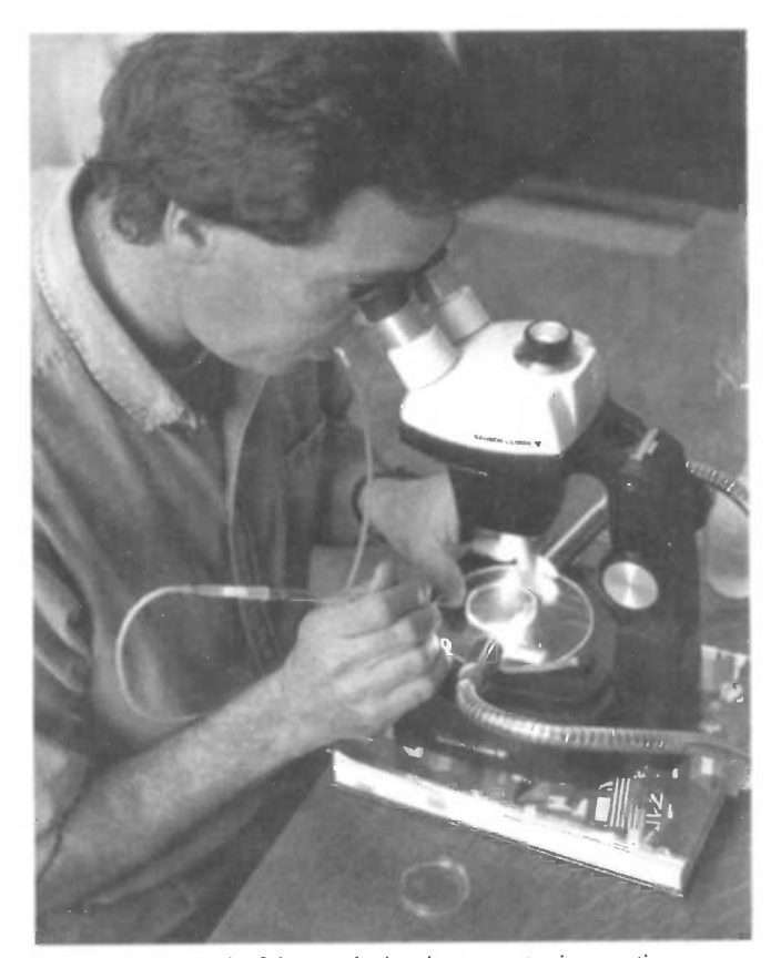
Figure 1 Photograph of the mouth pipetting apparatus in operation

ing length (ca. 60 cm) with one end fitted to the mouthpiece and the other end placed on the taper of the disposable pipette tip. A small swab of cotton was placed inside the disposable pipette tip to absorb moisture. The Pasteur pipette was prepared by heating over a flame and drawing out to an approximately 100- \mu m orifice. This was then inserted into the large opening of the plastic disposable pipette.