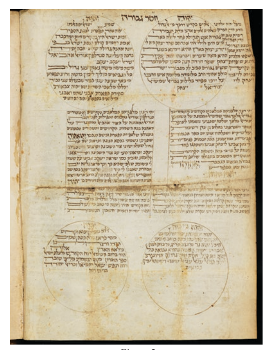
Figure 2 The Bodleian Libraries, University of Oxford. MS Michael Add. 18, folio 63v. Creative Commons licence CC-BY-NC 4.0.

not only copied Qabbalat 'Eser Sefirot , but also read and annotated the Abulafian Ḥayyei ha-'Olam ha-Ba' in the first part of the codex, placed two poetical pieces at the beginning and end of the volume, and finally adduced on its last page four short magical pieces that seek the divine name to achieve supernatural protective power over harming spirits. <sup>54</sup> The overarching principle for the compilatory project, one that connects practical kabbalistic commentary on the deployment of angelic names and ten sefirot with the Abulafian text on performative uses of the divine name, can be read out of the scribe's highlight on folio 54v, where their handsome manicula points to the line: "through the gradual emergence of the name you will comprehend everything that I mentioned to you on this matter, and through the knowledge of the name you will comprehend everything." <sup>555</sup>