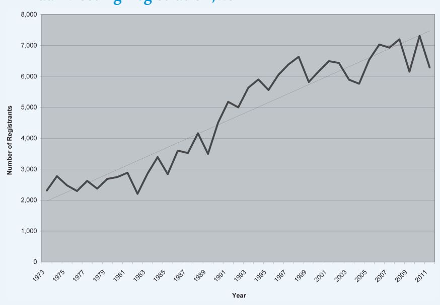
Figure 2 Annual Meeting Registration, 2011

and convenient for chairs to communicate among themselves and with the association.