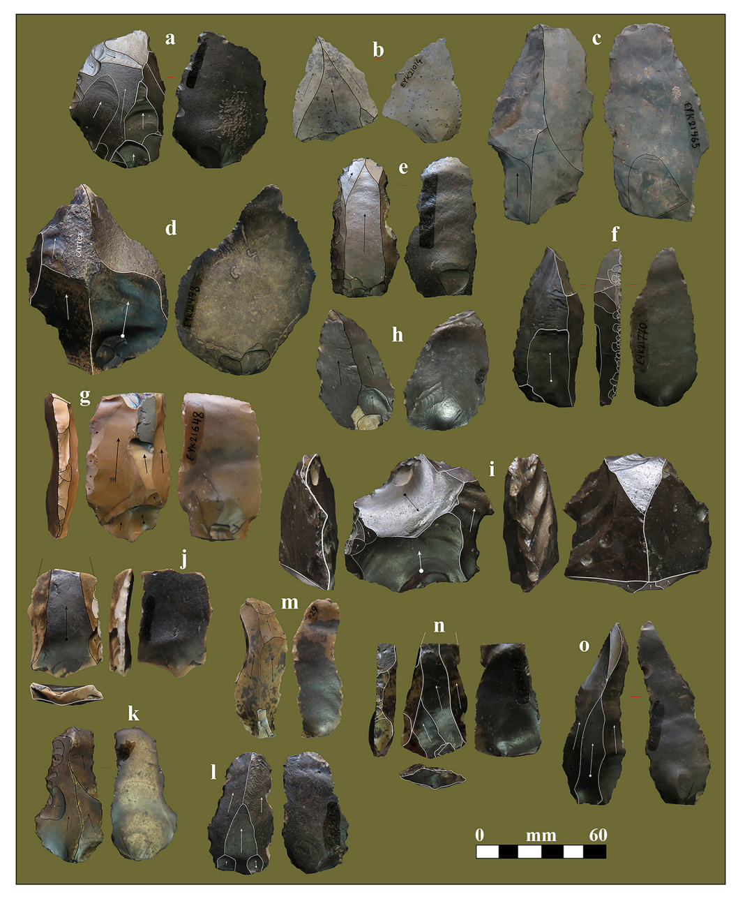
Figure 2. Selected lithics from Eyvanekey: a-l) attributed to Middle Palaeolithic; a, c-h & b | pieces with basal trimming for hafting(?) with e and g being sidescrapers and f being a convergent scraper; b) Levallois point; i) atypical Levallois flake core; j) elongated Levallois point(?); k) sidescraper on an atypical blade; m-o) attributed to Upper Palaeolithic, artefacts made on blades with negative bladelet scars (figure by authors).