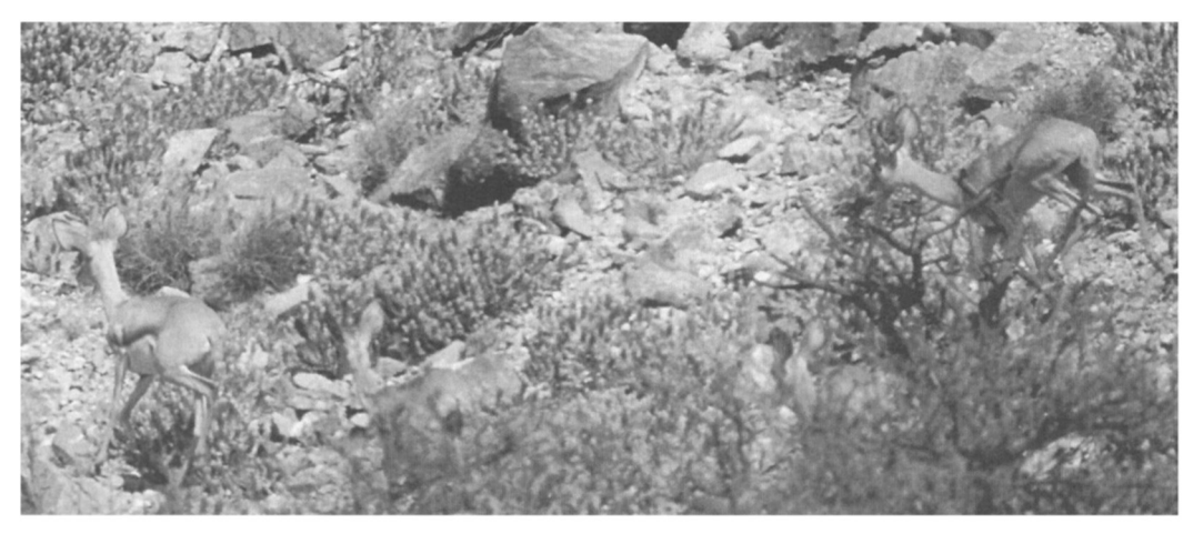
Dorcatragus megalotis, Djibouti 1994 (Thomas Künzel).

between the Government of Djibouti and the opposition, the situation is returning to normal and wildlife surveys should become possible in the future.