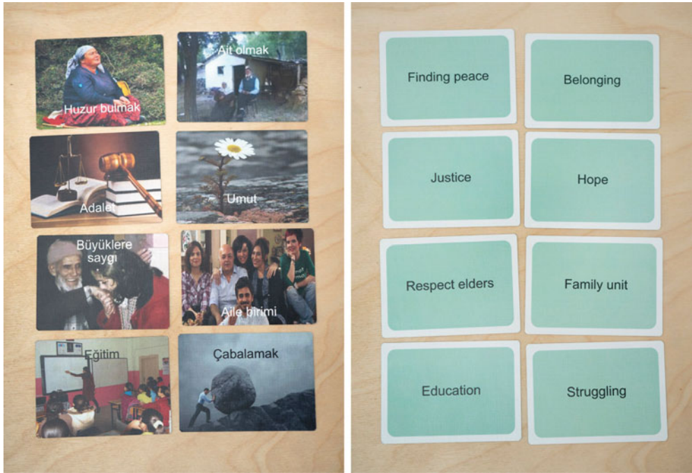
Figure 1. Turkish collectivist ‘value cards’

on the bus’, Chinese finger traps). The culturally adapted ACT group protocol was renamed: ‘Farkındalık ve Şevkatle Kabullenme’ (‘Acceptance with Mindfulness and Compassion’).