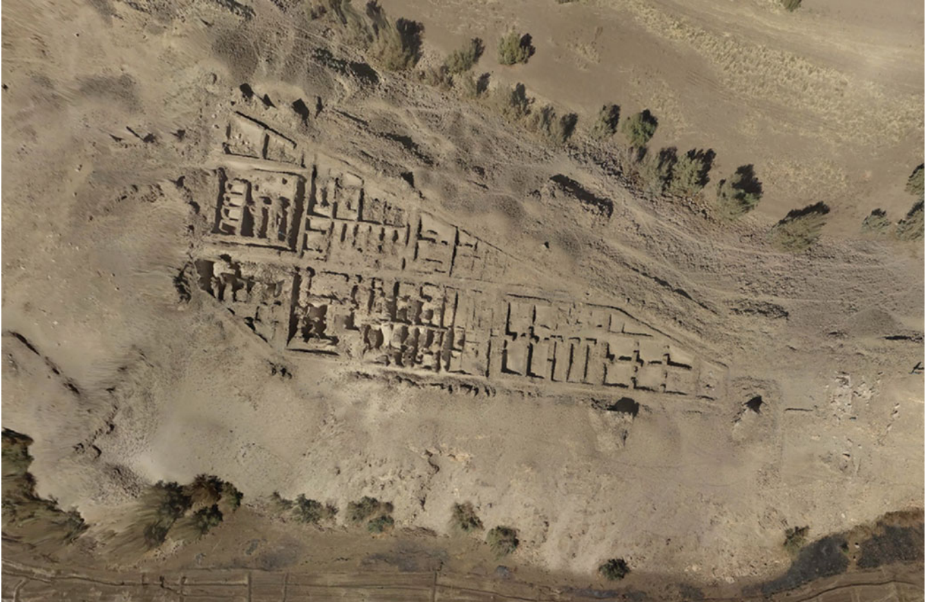
The remains of a nineteenth century BC Egyptian mudbrick fortress at Uronarti, Sudan. This orthorectified image was produced using a 3D model created from a series of kite aerial photographs.