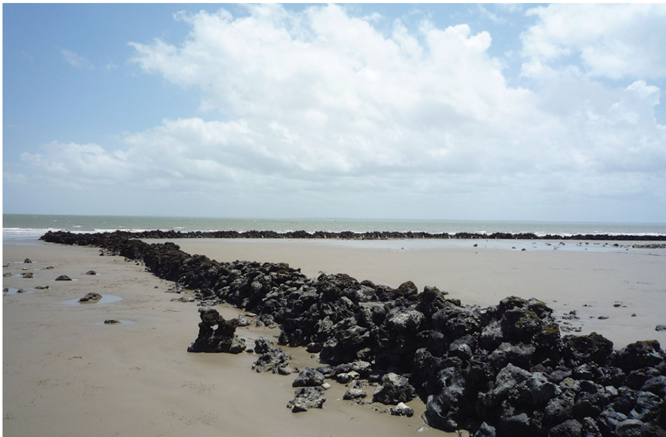
Early Europeans who visited the Maranhão region of northern Brazil during the seventeenth century described the use of camboas (fish traps) by indigenous groups. Local communities today also attribute these traps to past indigenous populations. Their precise chronological and cultural origin, however, is unknown. The fish traps are made of locally sourced materials including plinthite and petroplinthite.