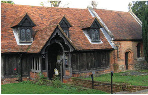
St Andrew's Church at Greensted in Essex, showing the eleventh century timber walling of the nave.

setting. Shortly after reading about the Nazca episode, I had opportunity to revisit a much smaller but still striking example of unusual preservation at Greensted in Essex, not far outside the London suburbs and within the commuter belt—until its closure in 1994 the station at nearby Chipping Ongar marked the terminus of the London underground Central Line. A narrow side road from Chipping Ongar leads past the few houses of Greensted to the Church of St Andrew, the sole surviving example of an early medieval timber church in England. It claims to be the oldest wooden church in the world.