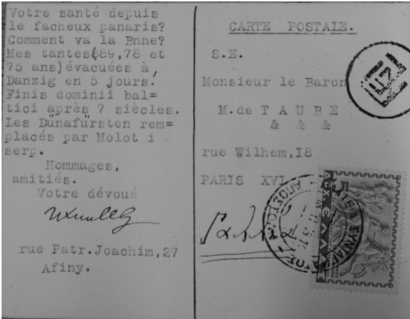
Figure 23 Baron Üxküll von Gildenband to Baron von Taube, 31 May 1931, in Mikhail von Taube papers, Bakhmeteff Archive, Columbia University Special Collections

hammer and sickle became a non-dialectical symbol, a brand showing the unity of workers and peasants; by contrast, the animals and other symbols typically shown on the emblems of old families are there because they are symbols of the powers that had been defeated by the power bearing the insignia. 66 The intertextual irony in the private correspondence of the Baltic Barons was a kind of ‘elite subalternism’ in response to the hegemonic use of chivalric symbolism by organizations such as the VchK, the Soviet security organization founded by another Balt, Feliks Dzerzhinsky, and the Hammer and Sickle emblem itself. The new emblems of honour