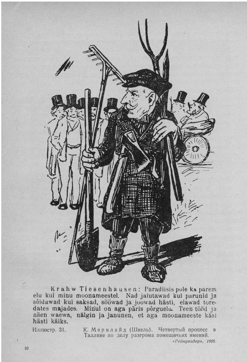
Figure 21 K. Merilaid (Schnell), caricature on the Tallinn case concerning the plundering of baronial estates. From Reinuvarder (1906), in I.P. Solomykova, Eestonskaia demokratcheskaia grafika perioda revolutsii 1905–1907 godov (Tallin: Estonskoe gosudarstvennoe izdatel'stvo, 1955), 145