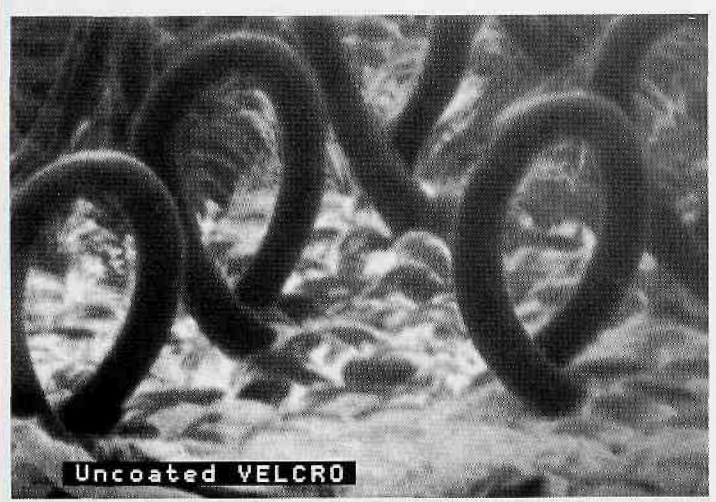
Figure 1. a) Ultra low accelerating voltage image of an uncoated Velcro sample taken with 100 eV accelerating voltage in 1987 with an SEM equipped with a lanthanum hexaboride electron source.

In the mid-80s visionaries saw the need and possibility of the application of SEMs in the inspection and metrology of semiconductor production samples. Device and integrated circuit feature sizes were shrinking below the optical microscope capabilities achievable at that time. Low accelerating voltage operation was chosen for its potential