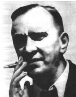
Stefan Banach, 1898–1945

A second source of inspiration was the discovery, in the 1920s by John von Neumann, that the – at that time brand new – theory of Quantum Mechanics can be put on a solid mathematical foundation by means of the spectral theory of selfadjoint operators on Hilbert spaces. It was not until the 1930s that these two lines of mathematical thinking were brought together in the theory of Banach spaces, named after its creator Stefan Banach (although this class of spaces was also discovered, independently and about the same time, by Norbert Wiener). This theory provides a unified perspective on Hilbert spaces