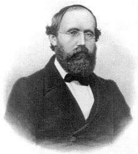
Bernhard Riemann, 1826–1866