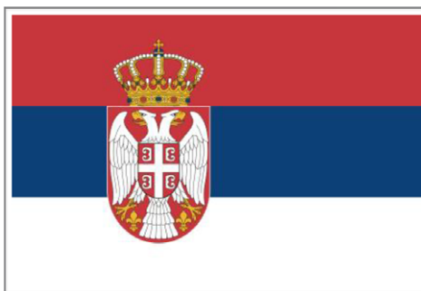
Figure 7. State Flag of the Republic of Serbia

Nationalist Bosnian Serb leaders want to hold a referendum on the secession of Republika Srpska from the state of Bosnia and Herzegovina. Republika Srpska was created through genocide and war crimes, purging non-Serbs from villages and towns where in some cases non-Serbs had been a majority. The legitimacy of Republika Srpska as an entity in Bosnia and Herzegovina was regrettably established by the Dayton Peace Accords. The entity was artificially constructed in Dayton in 1995; historically and culturally, the entity had always been an authentic and integral part of Bosnia and Herzegovina.