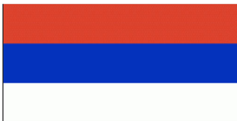
Figure 3. Entity flag of Republika Srpska in Bosnia and Herzegovina.

Herzegovina. Only the entity flag of Republika Srpska remained in use because, as mentioned, in the opinion of the Constitutional Court of Bosnia and Herzegovina, its appearance did not include elements of discrimination. Throughout the whole of the entity of Republika Srpska, there are virtually no state symbols for Bosnia and Herzegovina. The entity symbols of Republika Srpska prevail. The political sentiment behind secession and seeking an ethnically pure entity after purging non-Serbs from the territory during the war is reflected in the following observation: “Perhaps a more secure position—within a stable state with fully ‘banalised’ nationalism—from which they could comfortably claim privileged membership and the right of ‘management of national culture and territory’ would be advisable because it would alleviate the tensions and open up the space for more democracy” (Spasić 2017, 44). Privileged membership, though, does not alleviate tensions in modern societies and does not open up space for democracy. The problem is that privileged membership and democracy are incompatible.