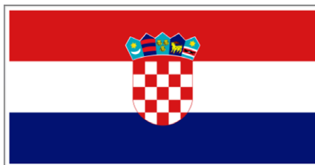
Figure 6. State Flag of the Republic of Croatia

Source: Mareco Index Bosnia, Sarajevo, September 2018, \chi^2(3, N = 464) = 89.3, p < .001 .