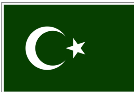
Figure 4. Flag of the Islamic Community in Bosnia and Herzegovina.