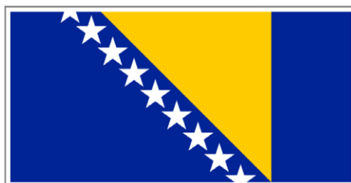
Figure 1. State Flag of Bosnia and Herzegovina

Source: Mareco Index Bosnia, Sarajevo, September 2018, \chi^2(3, N = 464) = 127.7, p < .001 .