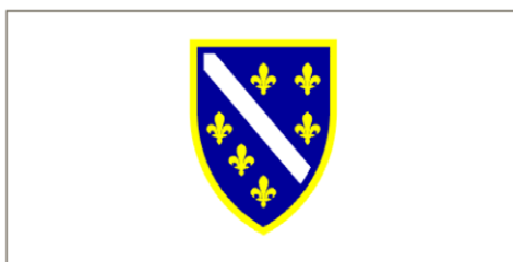
Figure 2. Original Flag of the Republic of Bosnia and Herzegovina

Republika Srpska is a Bosnia and Herzegovina entity in which the majority is Serbian as result of genocide during the war from 1992–1995, euphemistically called ethnic cleansing. The flag and the coat of arms were created in 1992, and in its original appearance lilies were incorporated, which were also imitations of the coat of arms of Serbia (see figure 3). However, when Bosniaks began to identify themselves with the lilies on the Bosnia and Herzegovina flag, the lilies from the coat of arms of Republika Srpska were removed, although they remained on the Serbian coat of arms and flag. In 2007, the Constitutional Court of Bosnia and Herzegovina ruled that the symbols of both entities in Bosnia and Herzegovina (the anthem, the coat of arms, and the flag of the Federation of Bosnia and Herzegovina, and the coat of arms and the anthem of Republika Srpska) were unconstitutional because they discriminated against one of the constituent people in Bosnia and