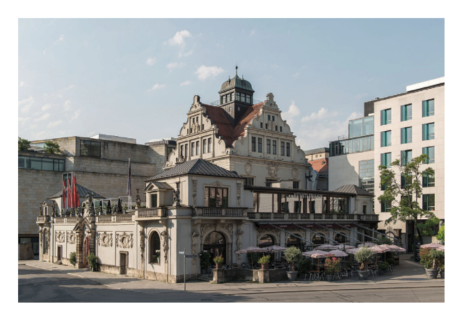
Figure 2. Künstlerhaus at the Lenbachplatz, Munich.

quoting a few passages: 'There seems to be a case for a less formal gathering, which we may conveniently term a Colloquium, on a level intermediate between those of the formal Symposium and the private visit. The subject matter to be discussed would either be more specialised than that generally chosen for a formal symposium, or at a less developed stage; the scope would be such that the participants, invited because they have something to contribute, can all be expected to follow the discussion fully. The Colloquium should restore the immediacy and directness of personal contact in lively and spontaneous debate on current work by people personally engaged on it, from which considerations of prestige are absent. The Colloquium should help to reduce the isolation of the working scientist which tends to result from the continual and rapid ramification of subjects, and it should lead him to notice aspects of his problem which he would otherwise have ignored (...)'.