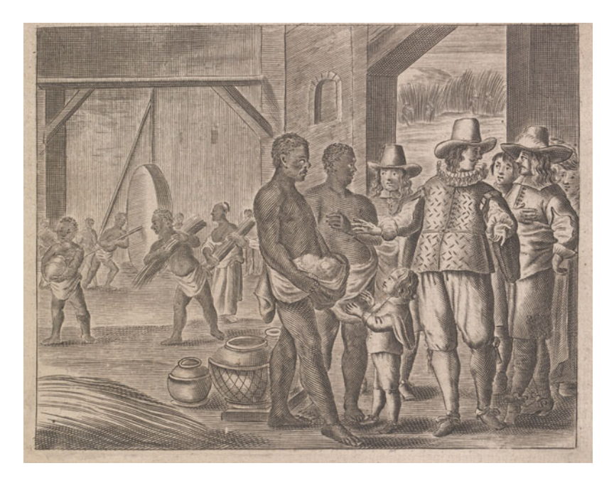
Figures I, 2. Continued.