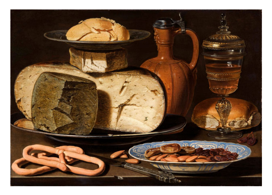
Figure 4. Clara Peeters, Still Life with Cheeses, Almonds, and Pretzels, 1615, oil on panel, 34.5 × 49.5 cm, 1615, Mauritshuis.

The final example of politicizing health and the body in Van Beverwijck's work is found in Chapter 10 of the second part of the Treasure , on the ideal lifestyle and diet for adults. Cats's opening poem for this chapter is almost satirical in nature and a stark contrast with the previously discussed poem from the chapter on sugar and spice. Here, Cats states that what is sent to Holland from faraway coasts is the preferred food for those with a fad for strange and expensive tastes, such as Bologna sausage and Moscow caviar. The poet and statesman argues that 'fish from our sea and meat from our stable' tastes much better than such exotic foodstuffs, and anyone who cannot appreciate the foods that Holland produces is 'a true glutton, or a wanton, spoilt child'.<sup>56</sup>