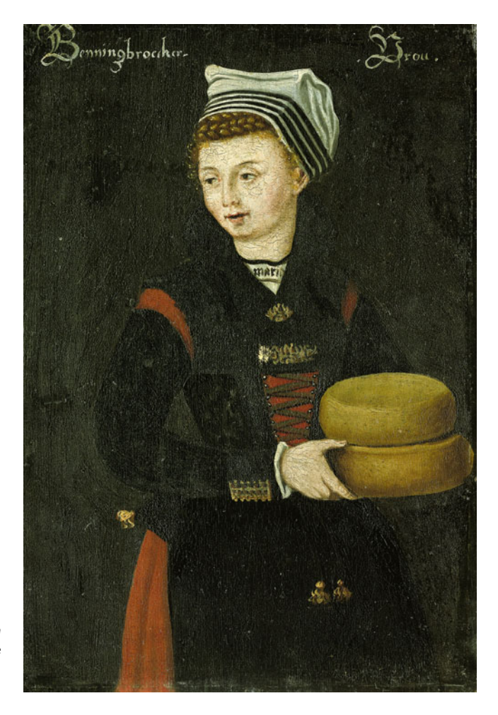
Figure 3. Anonymous, Woman with Cheeses from Benningbroek, in the Province of Holland, c.1550–74, Oil on panel, Rijksmuseum SK-C-1510.

the human body because of its high fat content. Consisting of three parts, butter, whey and cheese, the specific properties of each part meant that milk was a versatile foodstuff in Van Beverwijck's eyes. The warm, fatty nature of butter and the cold, dry, earthy properties of cheese meant that the liberal consumption of both made for a balanced diet. Butter was best eaten with bread – a belief going back so far that the Dutch word for 'slice of bread' in Van Beverwijck's book is boteram. Boterham in modern Dutch contains the word 'butter' ( boter ).<sup>54</sup> Van Beverwijck also gave very specific advice about the consumption of cheese. He pointed out that the quality of milk (and hence of the cheese made from it) was influenced by the animal's health as well as the season and the availability of fresh grass. The healthiest cheese was relatively soft, neither too old nor too salty, and mild-tasting; sweet cheese was to be preferred over sharp, overly solid cheese.<sup>55</sup> Of course, it was no coincidence that this was exactly the kind of cheese that was produced and consumed in abundance in Holland.