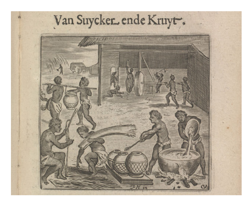
Figures I, 2. Illustration to the chapter 'Of sugar and spice' in Johan van Beverwijck's Treasure of Health , in the 1636 and 1660 editions respectively.