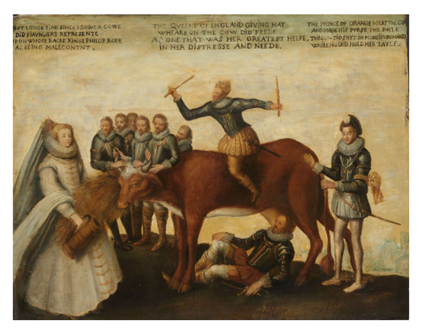
Figure 5. Anonymous, The Dairy Cow: The Dutch Provinces, Revolting against the Spanish King Philip II, Are Led by Prince William of Orange, the States General Entreat Queen Elizabeth I for Aid, c.1633–c.1639, oil on panel, 52 × 67 cm, Rijksmuseum SK-A-2684.

they lived soberly and in moderation, but that they lost it once they bathed in excessive wealth, thus implicitly comparing empires or states to households.<sup>59</sup>