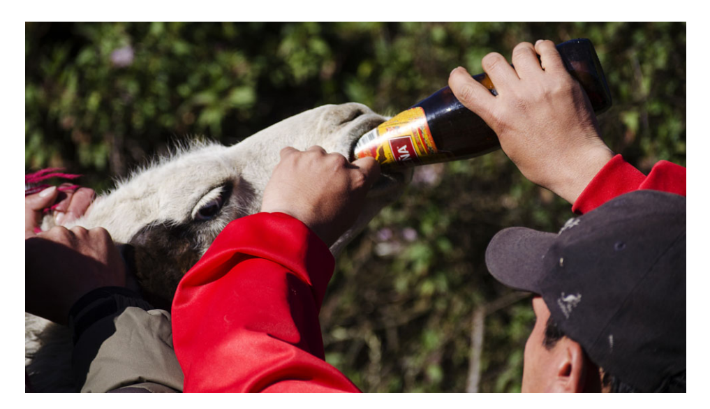
Figure 6. Qhapaq Qolla dancers giving beer to the dance troupe's llama. 2017.

serves an important role in the festivity—is meant to teach new dancers the importance of the labor of the people who work for/with the troupe. Servants are vital to the success of the festivity. While they are not in the spotlight during the celebration, they are as integral to it as the dancers themselves.