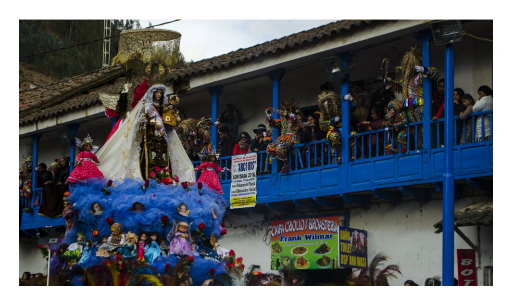
Figure 3. The image of the Virgen del Carmen out in procession during the festivity.

Qolla and my positionality, as they undoubtedly shape my ideas about the traditions of the troupe. I am Peruvian and was born in Lima. My mother is originally from the Cusco region, where Paucartambo is located, but she is from a town considered Amazonian rather than Andean. Thus, paucartambinos and paucartambinas do not consider either my mom or me Andean. Even when I tell them my mom is from Quincemil, they see that as anecdotal and not an indication that I have strong cusqueño ties.