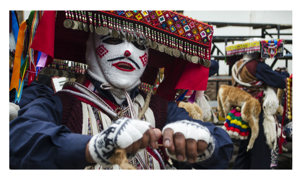
Figure 2. A Qhapaq Qolla dancer performing in the festivity. 2017.

After the meal, Qhapaq Qolla dancers who are considered antiguos —those who have danced for at least four years—gather in a private room within the cargo wasi to conduct a meeting in which they evaluate their performance during the festivity. Dancers call this meeting the t'aqwinakuy . The Qhapaq Qolla who are not antiguos cannot attend. The newest members of the troupe also cannot participate in the t'aqwinakuy . Their job as their peers conduct the meeting is to wash the dishes and clean up the kitchen.