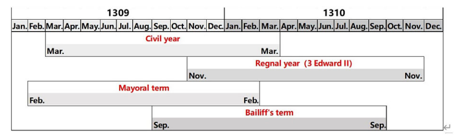
Figure 1. The co-existence of four dating systems, 1309–10.

An example can be given to illustrate this rather laborious verification process. A deed dated 17 May 1309 lists the following witnesses: Andrew Bolingbroke, mayor, and Alan de Scoyerschelf, Giles de Brabant and Adam de Pocklington, bailiffs. Based on this information, we can deduce that Bolingbroke served as mayor from February 1309 to February 1310, while Scoyerschelf, Brabant and Pocklington were bailiffs from September 1308 to September 1309.<sup>24</sup> It will be recalled that the mayoral term in York began in February, whereas the ballival term started in September (see Figure 1).