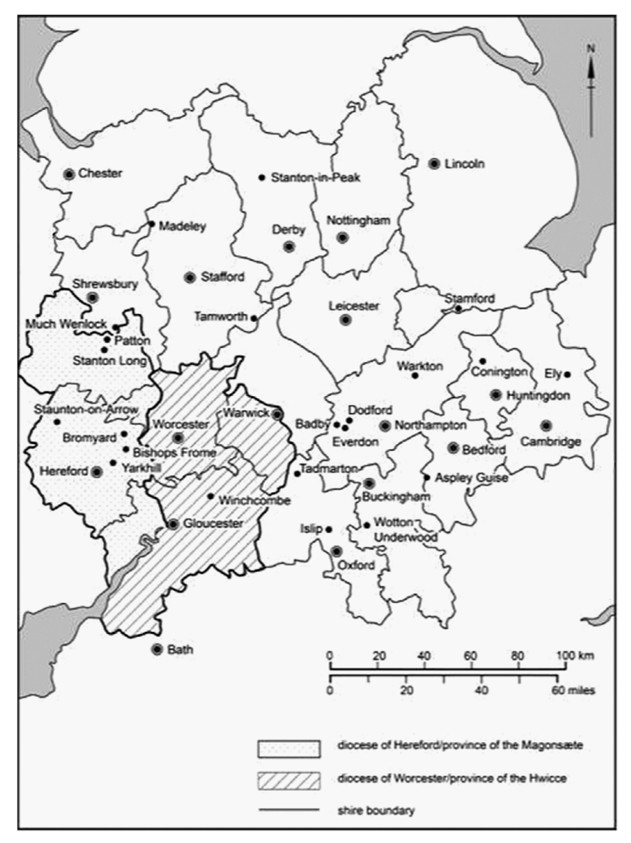
Figure 2: The midland shires in 1086 and, mapped onto them, the contemporary dioceses of Hereford and Worcester, all shown at their estimated extent. The two dioceses arguably mirror the extents of the former Mercian provinces of, respectively, the Magonsæte and the Hwicce. Named places are those referred to in the article. Map by author.