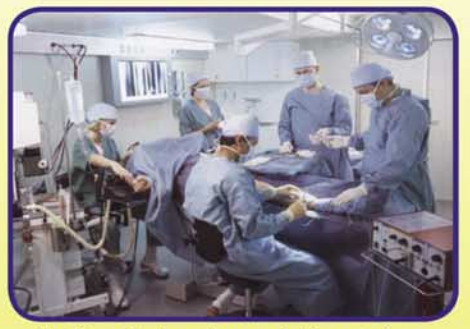
NorBase single and expandable containers

Number One in the world for partial and turn key solutions incl. Transportation, Erection, Management, Training, Maintenance, Education, Administration, Storage, Out sourcing, Medivac. etc.