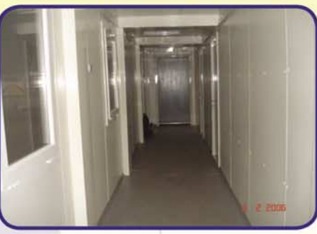
Inside MSF Hospital in Hattian Bala