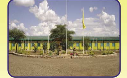
KATIKO Referral Hospital, Southern Sudan