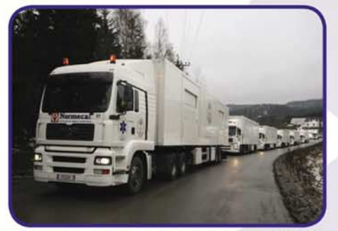
All kinds of clinics or hospitals in MultiSpace