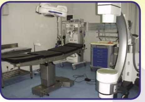
Inside OT in KATIKO Referral Hospital