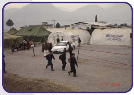
Cuban Hospital, Muzaffarabad, Pakistan