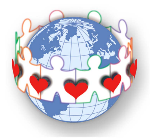
Figure 2. The logo of the International Society for Nomenclature of Paediatric and Congenital Heart Disease.

The feasibility of this project was established by the creation of a rule-based bidirectional crossmap between the two Short Lists by the Nomenclature Working Group of the International Nomenclature Society. <sup>26,27</sup> Over the next 8 years, the Nomenclature Working Group met 10 times, over a combined period of 47 days, to achieve the main goal of mapping the two comprehensive lists to each other to create the two dominant versions of IPCCC. <sup>28</sup>