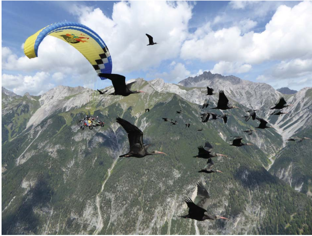
Microlight piloted by a foster parent leading northern bald ibises to the wintering site in southern Tuscany, Italy.

by human foster parents. After fledging the birds undergo a training programme to follow two microlights co-piloted by the foster parents. From mid August this migration leads in flight stages of c. 220 km per day from the breeding sites north of the Alps over c. 1,000 km to the wintering site in southern Tuscany, where the birds are released. During 2014–2019 a total of 154 birds were released. No release occurred in 2020 because of the COVID-19 pandemic.