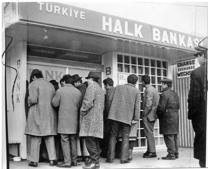
FIGURE 3.2 Guest workers send remittances at Türkiye Halk Bankası, one of the many Turkish banks with branches in West Germany, ca. 1970.

the Euromarket rate. Sweetening the deal, the publicly owned Turkish Republican Central Bank guaranteed the principal and interest against the risk of a potential lira devaluation. The Turkish government, too, benefitted from the CTLDs, which constituted short-term loans in Deutschmarks. In terms of process, the commercial banks transferred guest workers' deposited Deutschmarks directly to the Turkish Central Bank, which returned the adjusted sum in lira and further loaned the Deutschmarks to state-owned enterprises for the financing of imports, long-term investment projects, and the repayment of foreign debt. In 1975, luxuriating in the massive influx of foreign currency, the Turkish government extended the opportunity to hold CTLDs to all nonresidents, including foreign corporations. 71