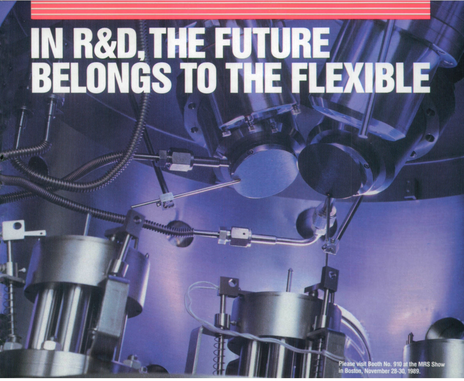
▲ A typical UHV internal arrangement for co-sputtering.

▼ Model 6000 modular UHV deposition system.