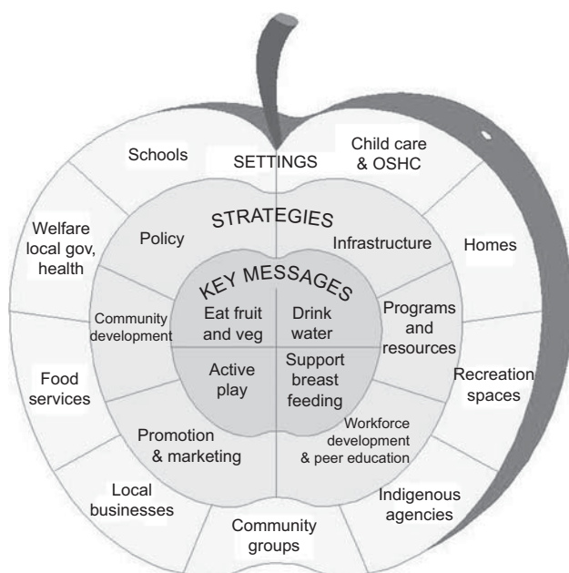
Fig. 1 Key messages, strategies and settings of the eat well be active Community Programs

means that individual behaviours associated with excess weight gain (including healthy eating and physical activity) must be addressed in the context of the environment and the societal and cultural factors relevant to the individual (6) .