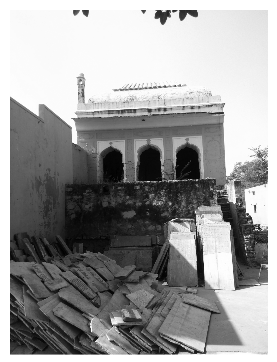
FIGURE 3.2 The decommissioned mosque at the Laldas shrine

the top of the main shrine's sanctum-sanctorum and the other in the exterior courtyard in front of the main entrance (Figure 3.2). These mosques were once utilised by Muslim villagers to offer namāz , but they are now closed. In recent decades, Hindu Laldasis forced the decommissioning of these