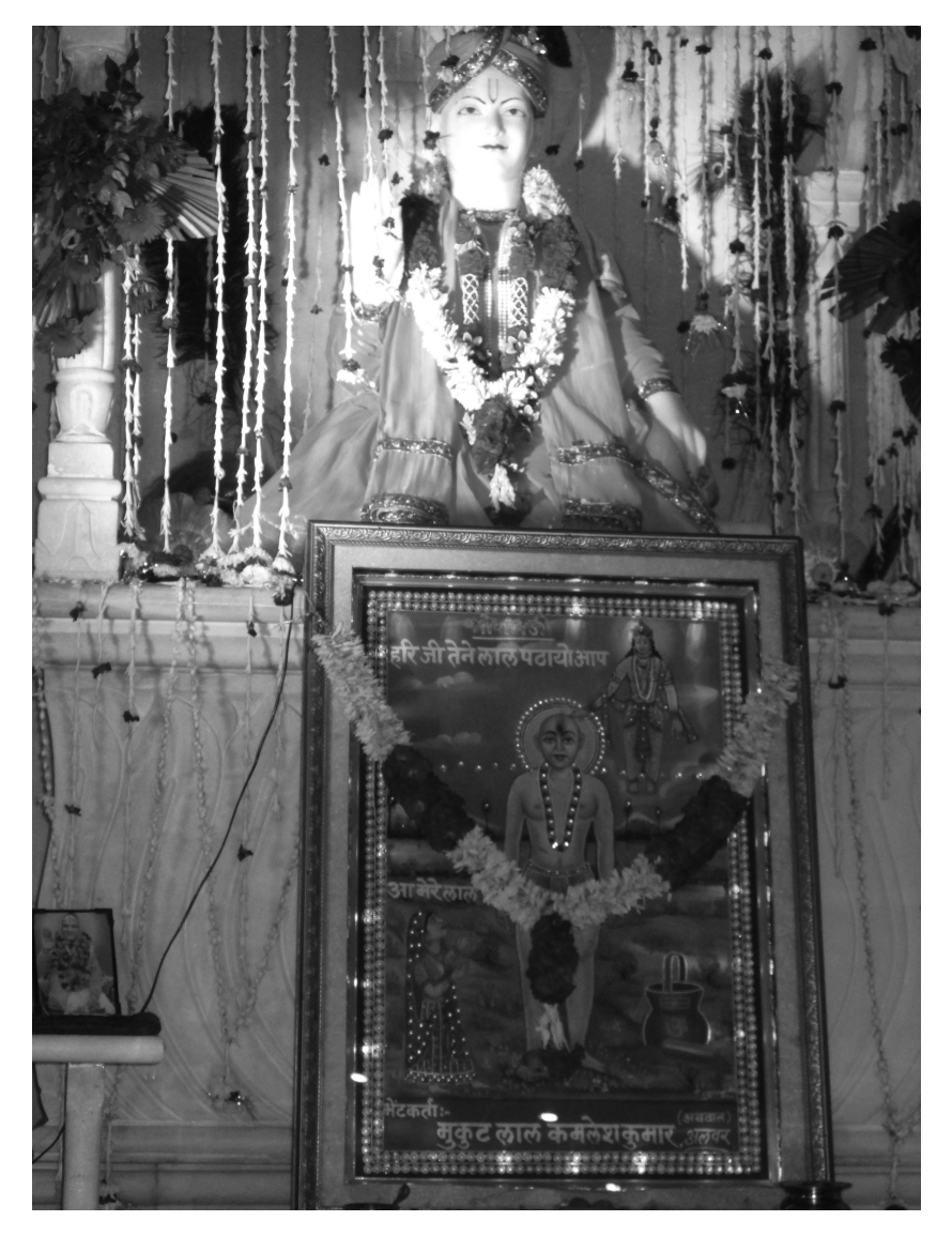
FIGURE 3.5 The deity Laldas in an anthropomorphic form for darśan

made significant efforts to improve the condition of peasantry contributing to the demise of traditional economic relations in the rural areas. This is the primary reason why all new temples of Laldas have been constructed after the 1990s, when the Baniyas could afford to disregard their traditional social and