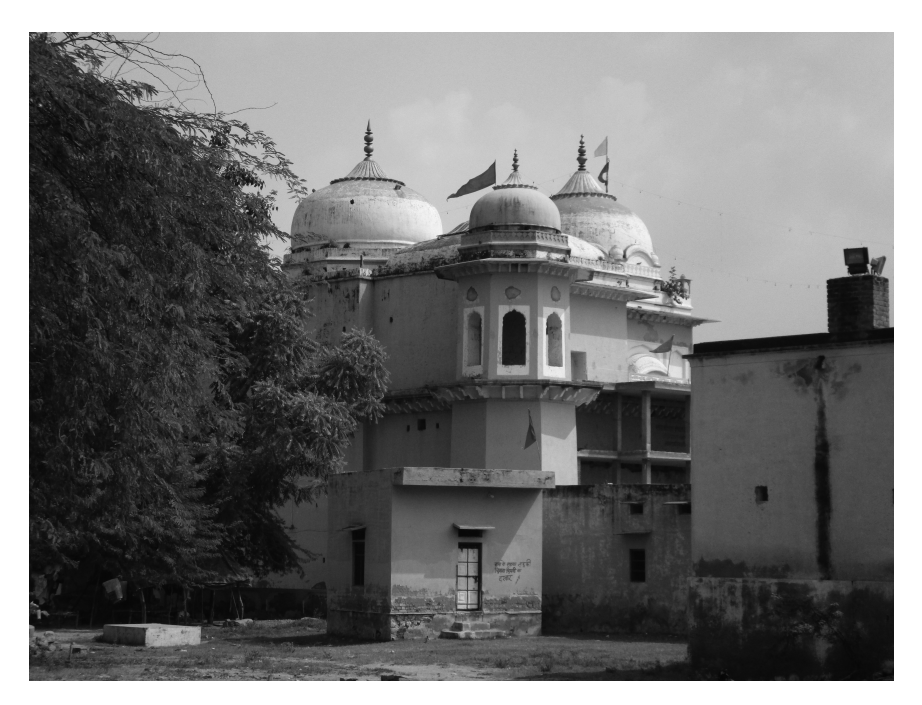
FIGURE 3.1 A side view of the Sherpur shrine