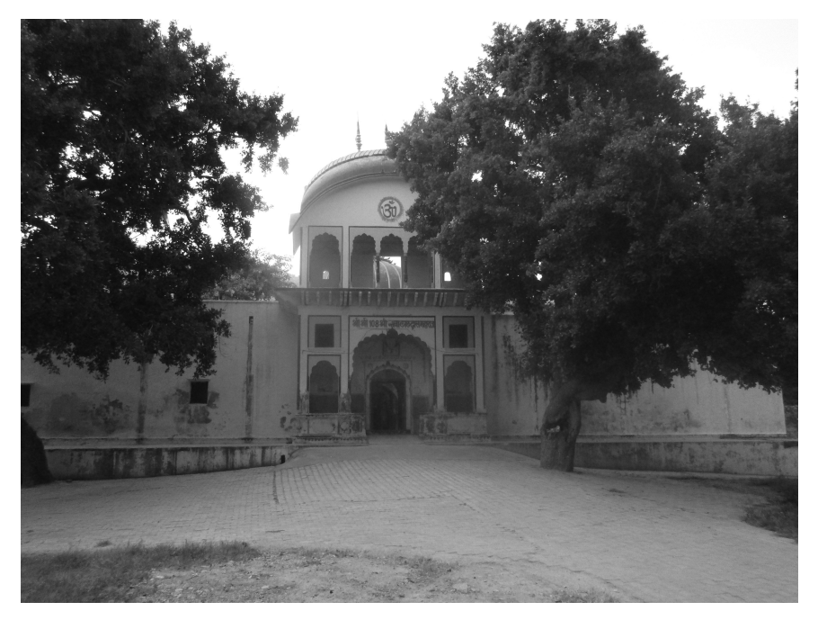
FIGURE 3.3 The Dholidoob shrine of Laldas, Alwar