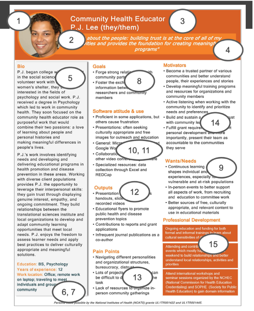
Figure 1. A key to the elements comprising each of the CTS Personas, with each element numbered on the template.