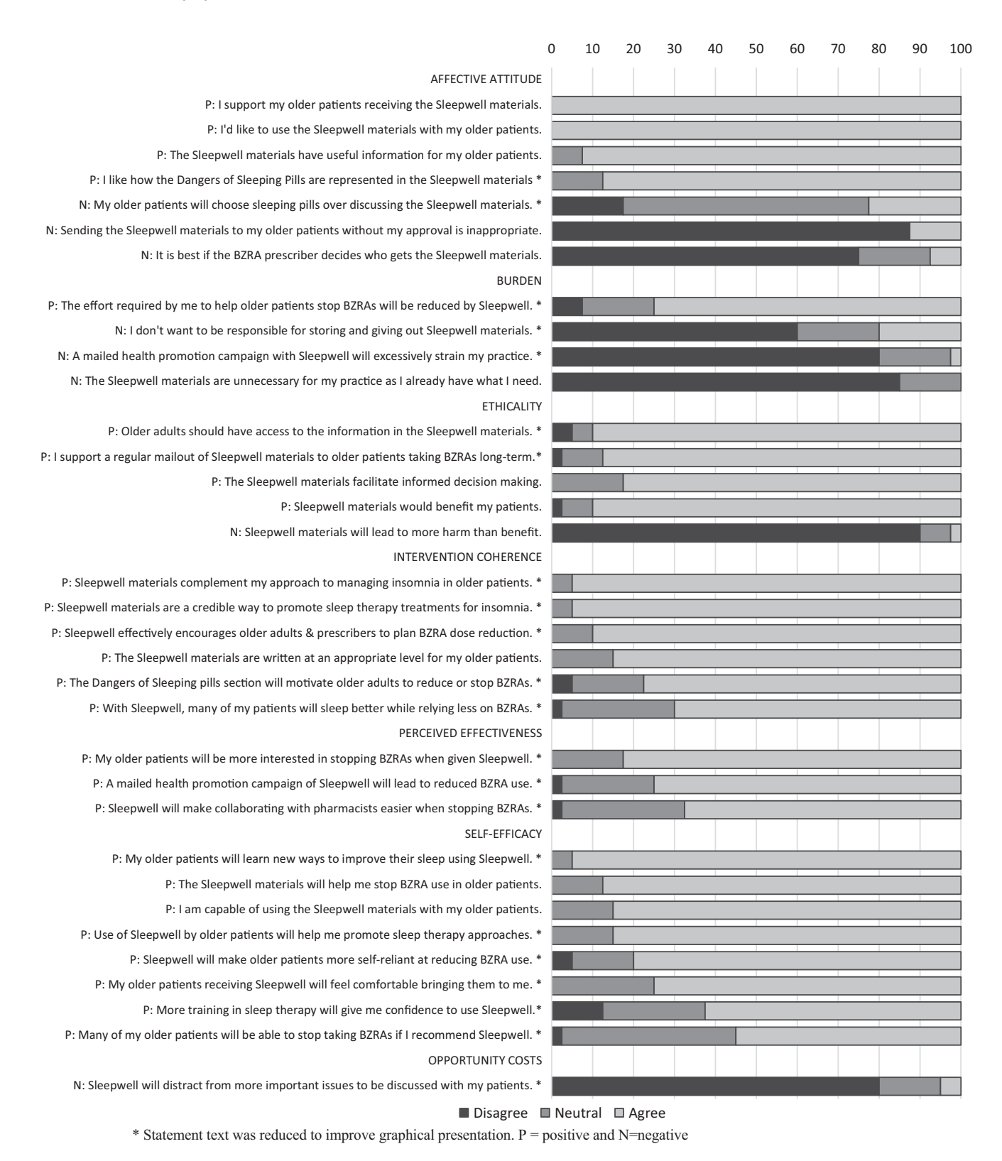
Figure 3. Prescriber agreement (%) regarding the Sleepwell direct-to-patient intervention. * Statement text was reduced to improve graphical presentation. P = positive and N=negative.

insomnia have been shown to influence BZRA prescribing decisions (Sirdifield et al., 2013). The limited breadth and frequency of application of CBTi components by the current sample could reinforce both patients' and prescribers' continued commitment