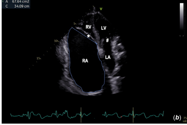
Figure 1. A: Cardiac magnetic resonance imaging (4-chamber view) at the age of 5. RA – right atrium, * - tricuspid valve, RV – right ventricle, LA – left atrium, # - mitral valve, LV – left ventricle. B: Transthoracic echocardiogram (4-chamber view) at the age of 10. RA – right atrium, * - tricuspid valve, RV – right ventricle, LA – left atrium, # - mitral valve, LV – left ventricle.

techniques like CT angiography or cardiac MRI. Periodic followup with echocardiogram and Holter monitoring should be focussed on detecting atrial enlargement, new symptoms, and uncontrolled arrhythmias needing intervention. In asymptomatic children, treatment is controversial. Antiplatelet drugs have been suggested as prophylactic treatment to prevent the risk of thrombus formation. In patients with an added risk of thrombophilia or atrial thrombosis, anticoagulation therapy should be associated. Antiarrhythmic medication can be used to control symptoms. Surgical reduction might be necessary for some symptomatic patients or asymptomatic patients at high risk of progression, such as those presenting with initial severe dilatation, significant enlargement over a short period, compression of adjacent structures, or uncontrolled arrhythmias.<sup>4</sup> Since it is a simple intervention with few post-operative complications, some authors defend surgical reduction as the treatment of choice in order to avoid the occurrence of thrombosis and arrhythmias.<sup>4,5</sup> Nonetheless other authors report significant post-operative atrial arrhythmias and recommend that this should be taken into consideration when considering surgery in asymptomatic patients. Taking into account the wide range of clinical presentations, it is reasonable to individualise management based on each case.7