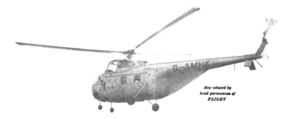
is fitted with