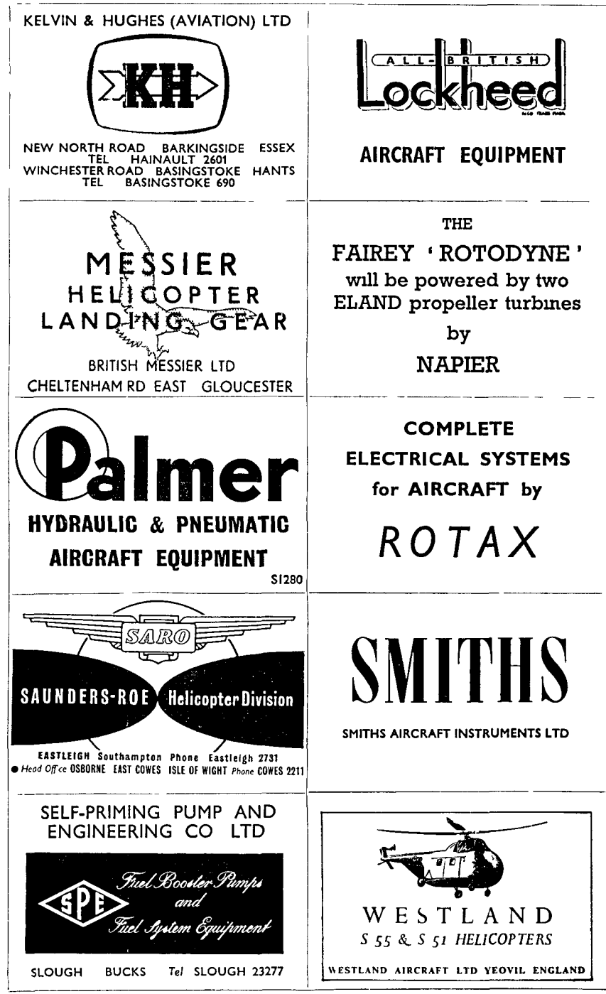
Published for The Helicopter Association of Gt Britain Ltd by JMP PUBLISHING SERVICES at Effingham House, Arundel Street, London, WC 2 Entered at Stationer s Hall