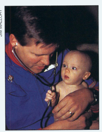
Don't miss the Pediatric Provider Program at EMS Today.

It's all part of the 10th anniversary of EMS Today. To celebrate, we're bringing you the biggest and best show ever, with more than 18 preconference workshops, 42 sessions, and 100+ exhibitors. All in the enchanting city of Albuquerque.