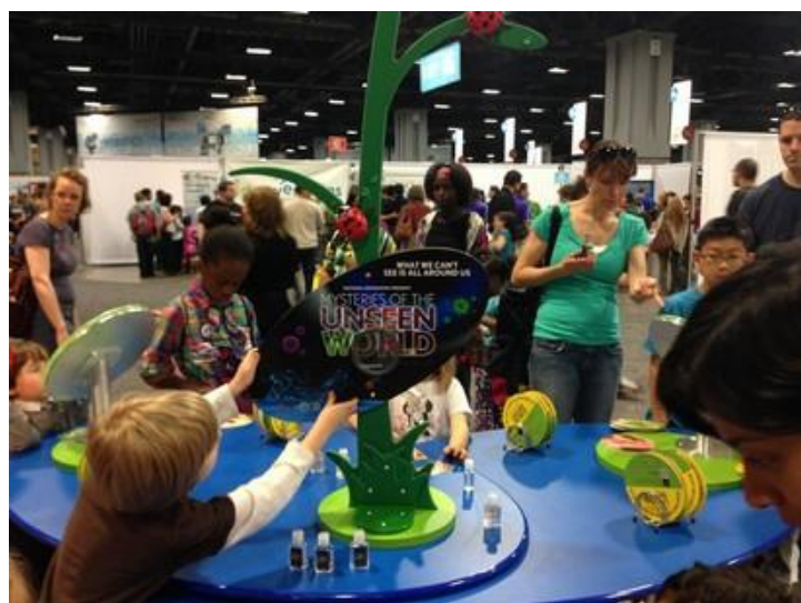
Figure 2. Students at USASEF learning about electron microscopy via the interactive kiosk