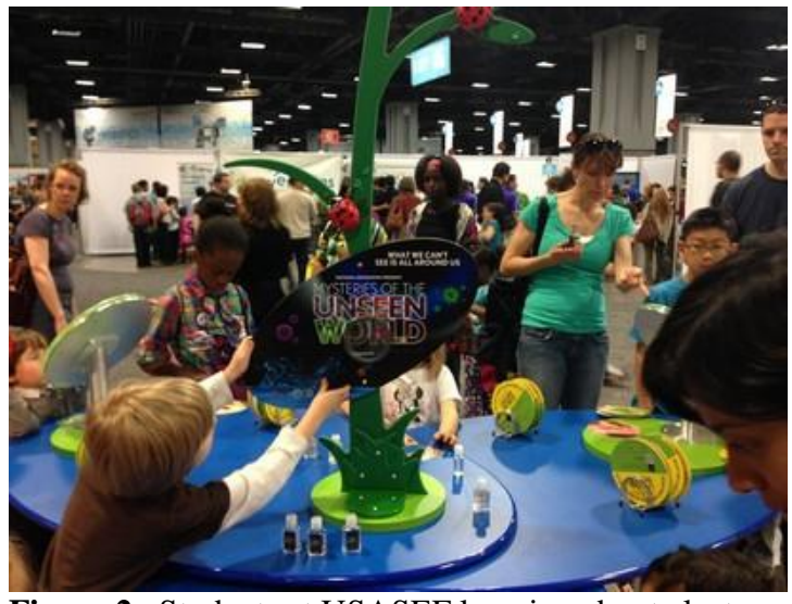
Figure 2. Students at USASEF learning about electron microscopy via the interactive kiosk