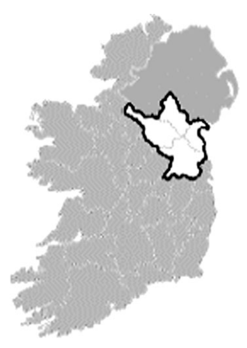
Fig. 1. Map of Ireland (showing NEHB counties in white).

The HIPE dataset presents a valuable means of retrospectively assessing notifiable infectious disease hospitalizations. Indeed, these hospitalizations represent the most severe illnesses due to notifiable diseases and therefore warrant an extra onus on hospital clinicians to notify. The aim of this study, therefore, was to determine for one health board region in Ireland, the level of hospitalizations due to notifiable infectious diseases and to compare these hospitalizations with notifications for the same period to examine whether or not there was any substantial under-reporting of these diseases by hospital clinicians.