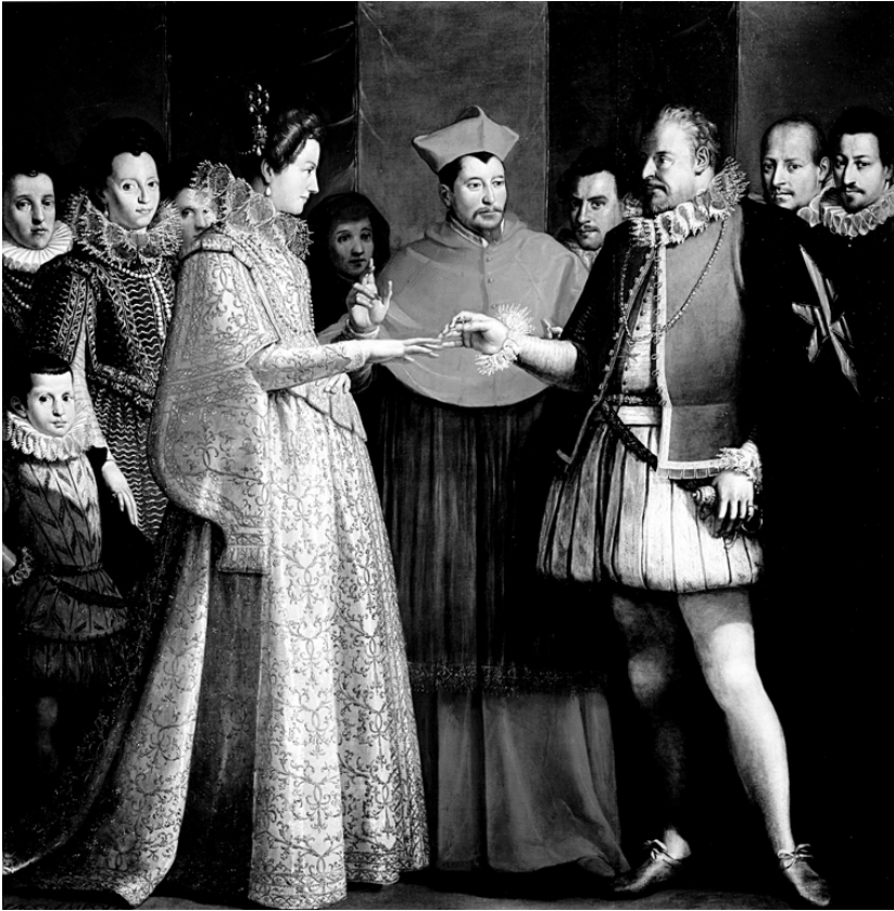
Fig. 1.1: Jacopo Chimenti da Empoli, The Wedding of Maria de' Medici and Henri IV of France (1600). Florence, Galleria degli Uffizi (Inv. 1890/10304).

For that earlier wedding, Chimenti had to draw on his imagination, but in his invoice for the two paintings submitted on 30 September 1600 (the week before the festivities), he made it clear that in the case of the current one he was representing those involved as they would indeed appear in the ceremony itself. 15 Buonarroti likewise wrote that the painting represented the ceremony