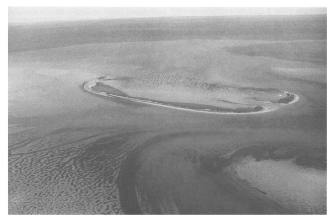
Aerial view of the Banc d'Arguin (J. Verschuren). Mauritania: wildlife and coastal park

Mauritania is a very large country with a human population density among the lowest on earth. Three-quarters of the country is covered by the Sahara Desert, and useful agricultural land is