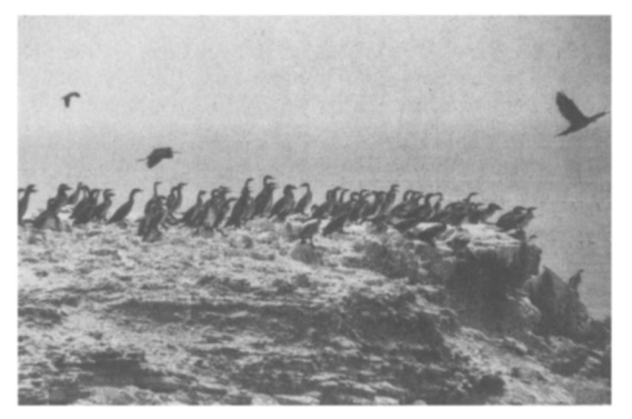
Cormorants nest in large numbers at the Banc d'Arguin (J. Verschuren).

third is coastal desert, one-third is sea and the rest consists mainly of extraordinarily high and low areas of land, which are partially uncovered at low tide: the extensive mud-flats are very productive biologically. It is also in the Banc d'Arguin that we find the northernmost mangrove swamp on Africa's Atlantic coast.