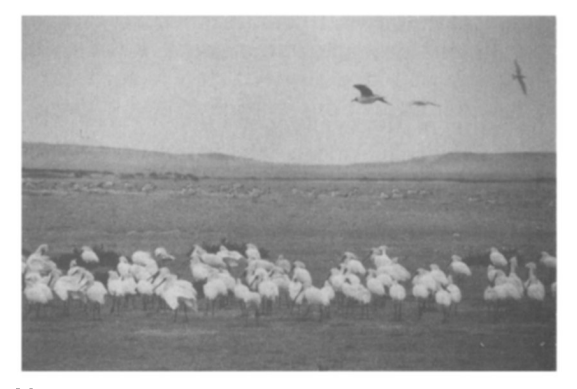
Many white spoonbills nest at the Banc d'Arguin (J. Verschuren).

What are the threats that face this exceptional natural reserve of comparable value, in global terms, to the Waddenzee in Western Europe? In the short term, it may be unfortunate that any surveillance is rather incidental, and protection is only assured in theory. The birds are safe, but guards would be essential to put an end to the poaching of the last gazelles, if indeed it is not already too late. The Parc National du Banc d'Arguin is administratively autonomous, but dependent on the Presidency of the Republic. It is hoped, therefore, that the authorities will shortly take the necessary action. A scientific research station has been established at Iwik, on the coast, in the heart of the reserve, but it is often inaccessible. All activities in the Banc d'Arguin are determined by the extreme environmental conditions: the almost total absence of fresh water, almost total desert, and the perilous sea passages between the islands.