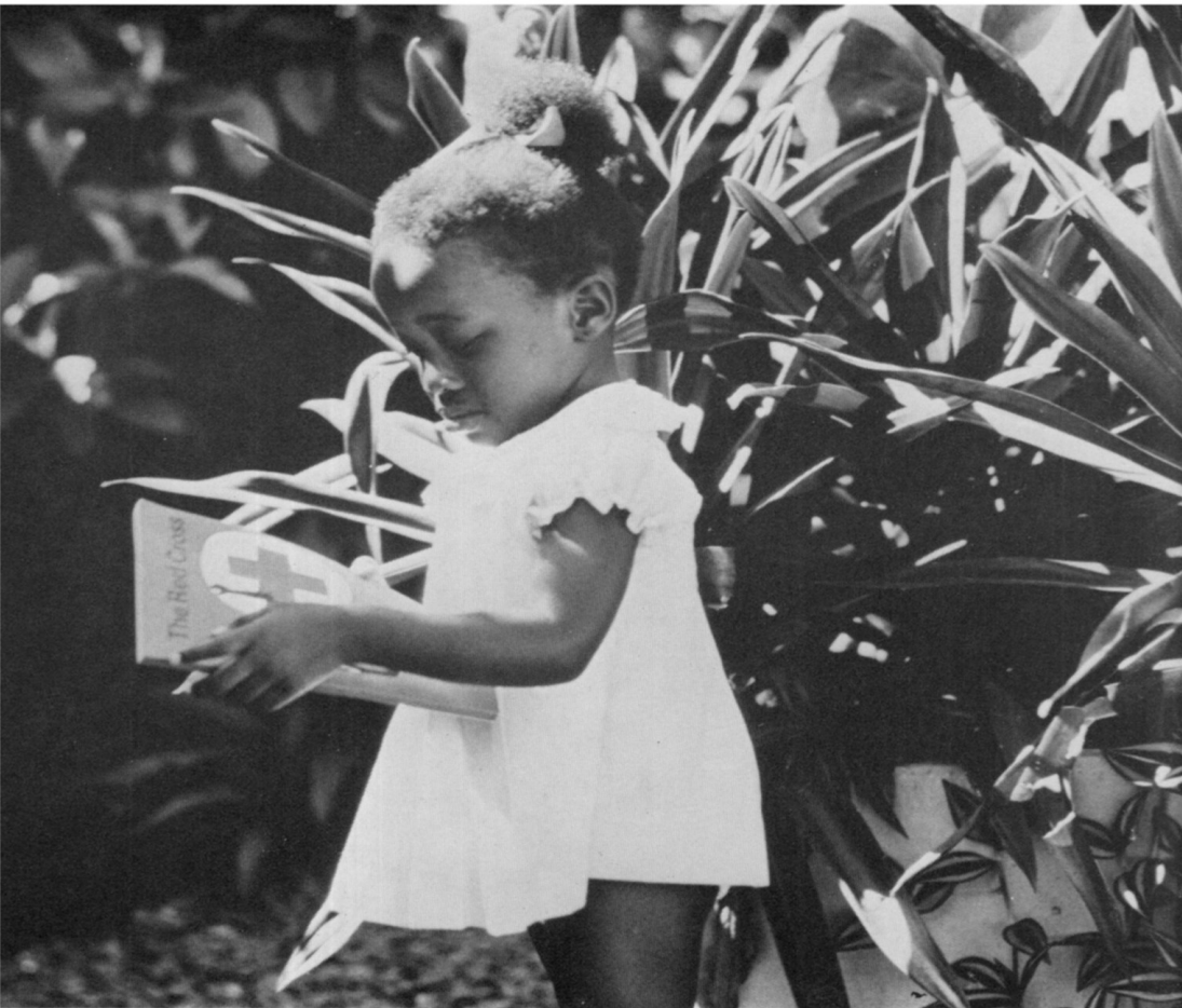
A little girl in Freetown, Sierra-Leone, is interested in the handbook.