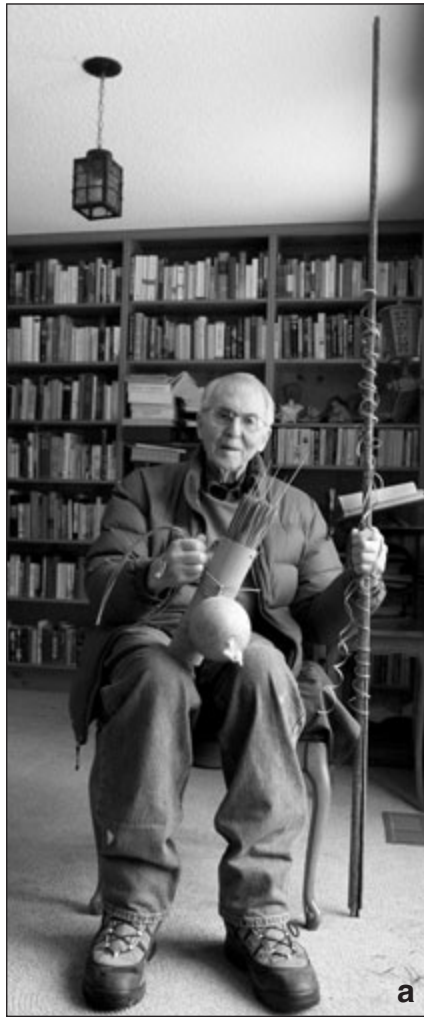
Figure 2: a) The author holding the blow-gun, quiver of darts and gourd of cotton to serve as a baffle wrapped around the base of a dart. All acquired from a native along the Amazon River. Note: After 45 years, the rubber covering of the gun has deteriorated. b) Dugout canoe paddles from the Amazon at Manaus.