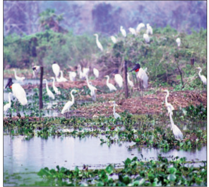
Figure 5: A marsh alongside the Paraguay River with egrets, spoonbills, ibises and Maribu storks all resting quietly. Our host's pistol shot raised a veritable cloud of marsh birds.