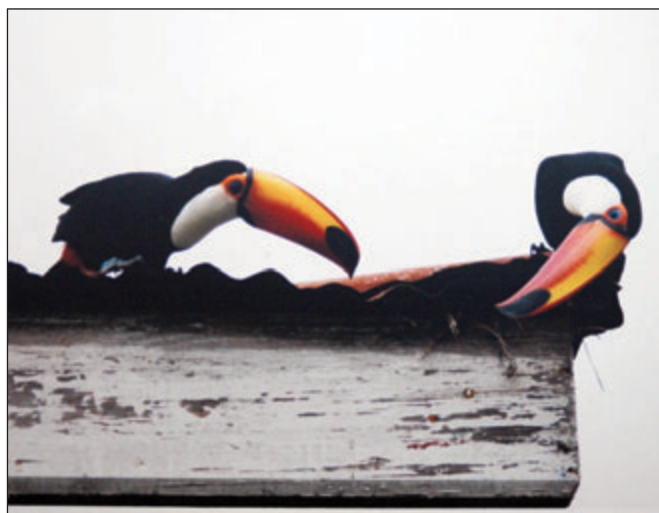
Figure 1: Two chestnut-mandible toucans picking insects under the shingles of an old shed at Iquitos, Peru.

With a 50 horse-power US built outboard attached to a big dug-out canoe, our guide took us down river to two ports of call. The first was a pre-arranged rendezvous with several male members of a jungle tribe each wearing straw skirts and each carrying a blow-gun. They demonstrated their ability to use their implements to kill parrots in a flock near the top of a forest giant. This contrived visit to a primitive tribe was rewarded by Schmitt