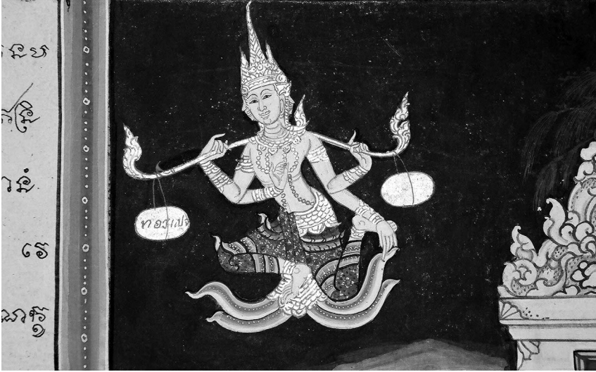
Fig. 3. Detail from a finely illustrated Phra Malai manuscript in Cambodian Mul script, 19th century; acquired by the British Library in memory of Henry D. Ginsburg. British Library, Or. 16552.