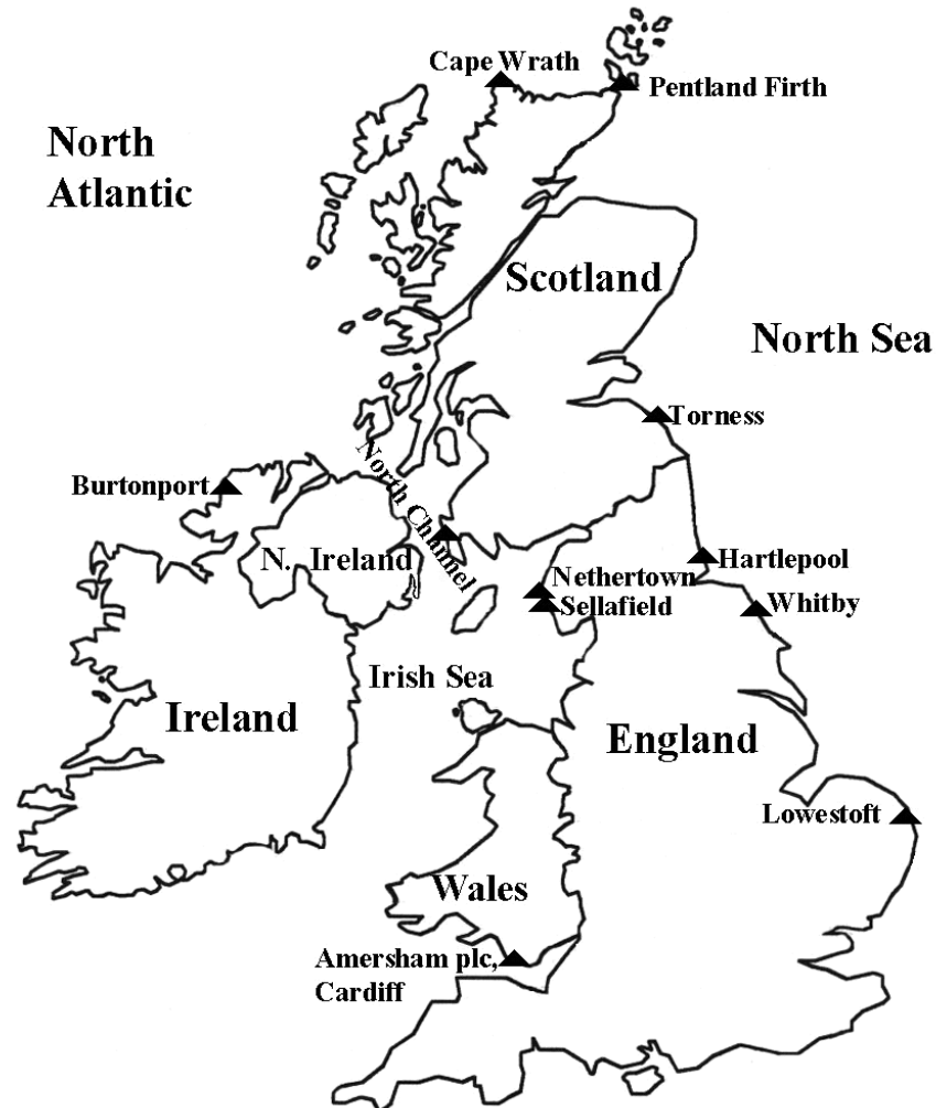
Figure 1 Map of the United Kingdom indicating sampling and other sites referenced in the text

east Scotland. Samples were obtained from the immediate vicinity of the Hartlepool AGR in 1998 and 1999, and from the vicinity of the Torness AGR in 1999.