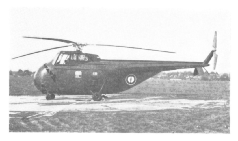
Westland Sikorsky S 55 as granted limited category A R B certification in July, 1954

Other experimental work has included modification of the Westland Whirlwind S-55 to take as alternatives to the Pratt & Whitney 1340/40 the Wright 1300 engine or the Alvis Leonides Major—both giving an even greater reserve of performance, particularly where take-offs or hovering is required at high altitude The S-51 has been following a similar course of performance development, and tests have included