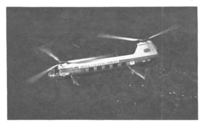
Bristol Type 173 Tandem Rotor Twin Engine Helicopter

Since the first of these machines made its maiden flight in January, 1952, a considerable number of flying hours has been completed and the type is justifiably regarded as the most advanced of the large helicopters now flying. Three more proto-