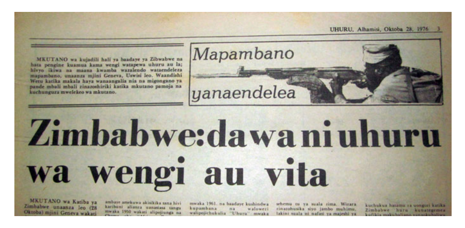
Figure 5. Communicating liberation struggles via heroizing iconographies: "The Struggle Continues" section in the party daily Uhuru , 26 October 1976.

Ginwala, who had edited the aforementioned Pan-African magazine Spearhead between 1961 and 1963, The Standard ran reports in anti-colonial registers from China's Xinhua and the Soviet news agency TASS, and it replaced terms such as "terrorists" with "freedom fighters" in contributions taken from Western agencies. " The Standard was unapologetically partisan, but it also remained critical vis-à-vis the government – albeit only for a short period.