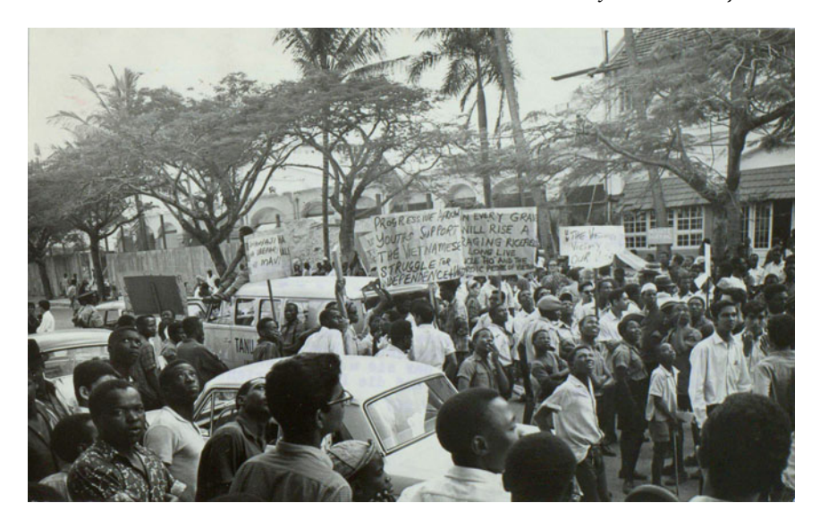
Figure 2. Protest against US aggression in Vietnam, in front of the US embassy, Dar es Salaam, 31 July 1968.