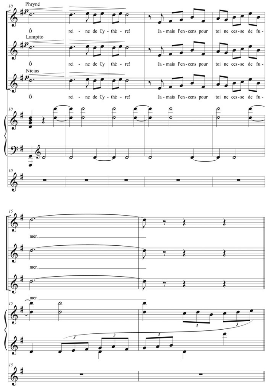
Ex. 2 Continued.

a path to a serious and intense emotional world (witness Mignon, Carmen, or Manon).