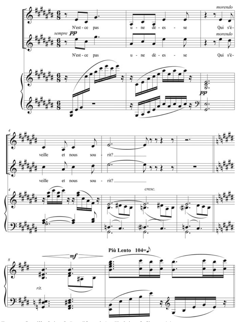
Ex. 3 Camille Saint-Saëns, Phryné, Act II, Scène de l'apparition

designers could make a mould of it. The exposure made good business sense for Campagne who the next year received a commission for a marble version, ostensibly from a rich American admirer of Sybil Sanderson, the soprano who created the title role. Although, unfortunately, an image of the statue was not photographed at the time, small castings did circulate and are even available from dealers today (Fig. 5). This is the Phryne of the trial, appearing as herself so that Aphrodite is only implicitly present in an imagined reaction of the viewer. The pudica convention