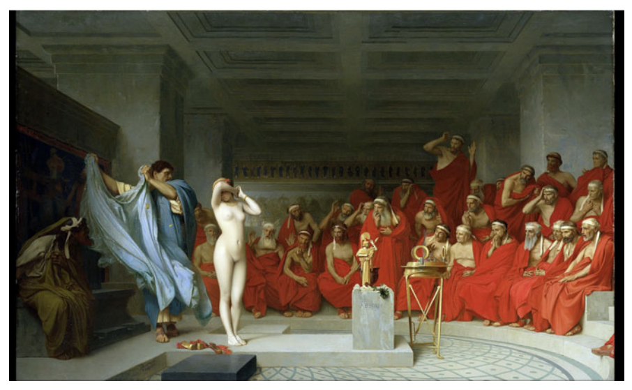
Fig. 1 Jean-Léon Gérôme, Phryné devant l'aréopage, 1861, Hamburger Kunsthalle, Hamburg