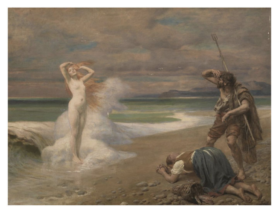
Fig. 3 Joseph Blanc, Apparition de Phryné, 1892

Mes long cheveux flottaient des zéphirs caressés, Les alcyons passaient allanguis et lassés. Tout à coup s'envolait ton grand nom, Aphrodite. Ainsi me saluaient étonnée, interdite, Les pêcheurs abusés dont les dieux s'égayaient. Excuse leur démence! Ils m'avaient aperçu, et c'est toi qu'ils voyaient, Comme en ce premier jour où, dans ta gloire immense, Ton beau corps ruisselant des pleurs du flot amer, Tu t'élevais superbe au-dessus de la mer!