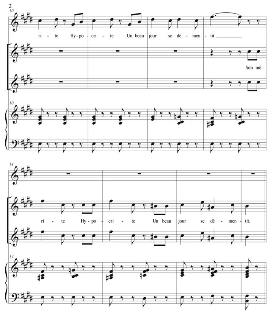
Ex. 1(a) Continued.

a frame of critical distance from the target?<sup>8</sup> The critic Ferdinand Le Borne wrote of a 'vulgarité voulue' (intended vulgarity) in the passage, and it is with this position that I agree.<sup>9</sup> My premise is that Saint-Saëns referred to Offenbach here only to distance himself from him, that is, to underline how different (better?) his approach to comedy really was. Or, if this was not exactly at the forefront of his intent, it provides us today with a useful critical hook to understand the classicistic foil to Offenbach that Saint-Saëns created.