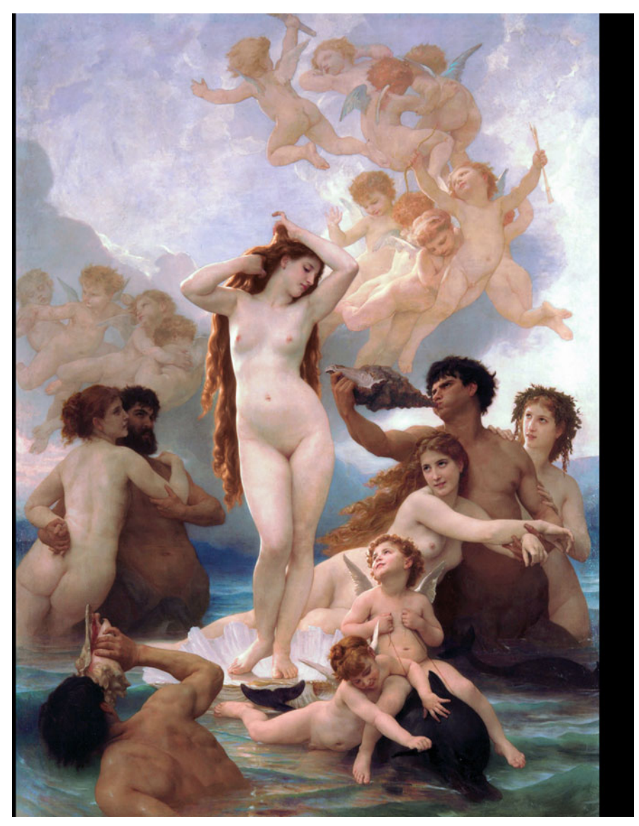
Fig. 2 William-Adolphe Bouguereau, La naissance de Vénus, 1879, Musée d'Orsay, Paris

arms. His figure also rhymes with the treatment of the female nude in Gérôme's Phryné devant l'aréopage and he more explicitly reminds the viewer that Phryne was the original model for Aphrodite Anadyomene by calling his painting Apparition de Phryné .