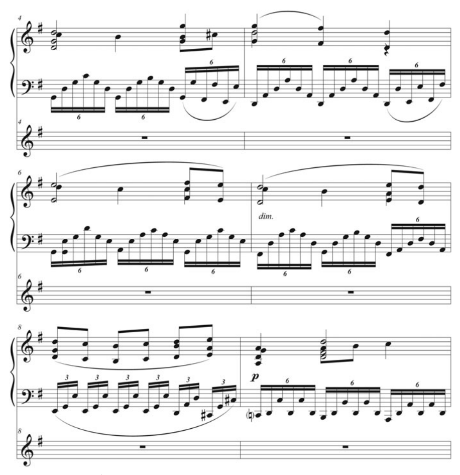
Ex. 2 Continued.

librettist during the genesis: 'My dear friend, I am done with this daunting piece showing Venus emerging from the waves, which has caused me much anxiety. It has now been fifteen days that I have turned it around in my head. I went first to listen to the soft murmur of the sea on the beach; I tried to render it musically; I began the scene but did not dare continue.'<sup>34</sup>