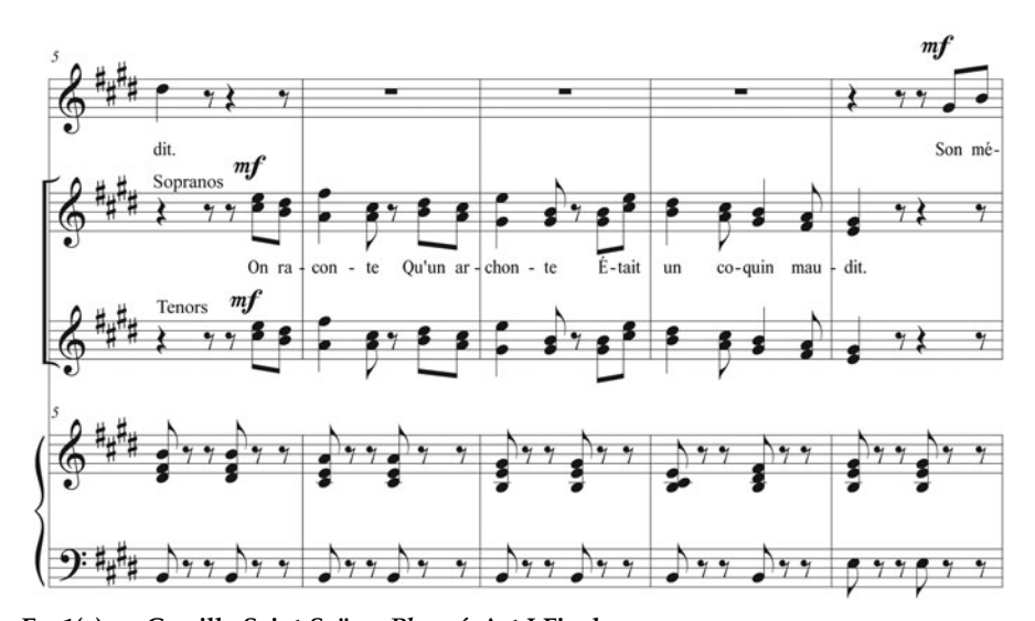
Ex. 1(a) Camille Saint-Saëns, Phryné, Act I Finale

on Dicéphile's bust in a public square. The quick turnaround of rhymes ('On raconte / Qu'un archonte / Était un coquin maudit / Son mérite / Hypocrite / Un beau jour se démentit'), mechanistic repetition of four-square musical phrases by the chorus, staccato choral underpinning (not shown), and skipping rhythms all give the passage an undeniably Offenbachian quality. Indeed, there are enough elements in common with the 'Anathème' chorus in the first act finale of Orphée aux enfers (in its 1874 revision) to suggest that Saint-Saëns may have had it in mind: similar rhythm, melodic motif, and phrase structure (Ex. 1b). Here Saint-Saëns would certainly not have approved of Offenbach's dubious prosody. The chorus repeats 'Anathème sur celui qui sans pitié' numerous times before the phrase is completed so that it makes sense 'Anathème sur celui qui sans pitié / Réfuse une larme même à son moitié'.