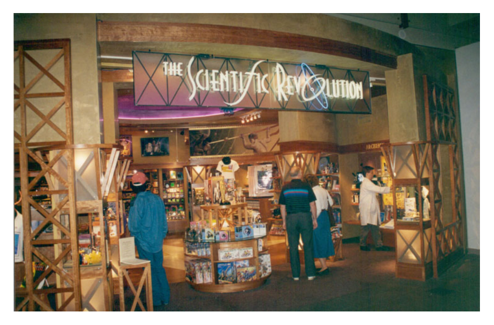
Figure 1. 'The Scientific Revolution', Mall of America, Minneapolis, Minnesota, 1994. Appropriately, this was a short-lived offshoot of the Nature Company. The shop assistants wore white lab coats, and potential employees were reassured that 'The Scientific Revolution is an equal opportunity employer'.

revolution tend to focus on questions of speed and suddenness, or whether a particular sequence of events genuinely constitutes a revolution.