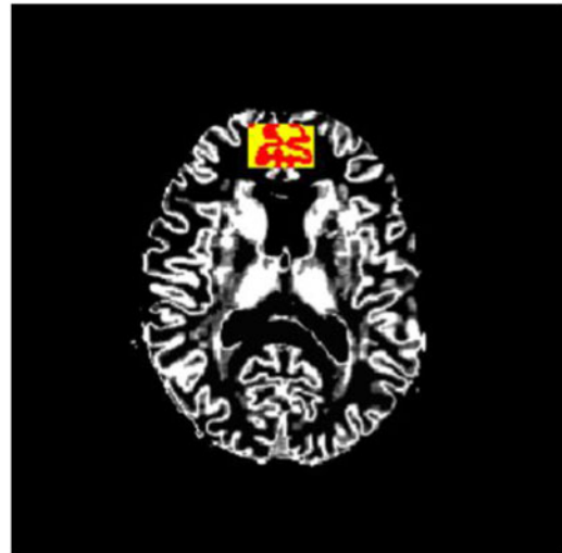
Figure 2. Binary mask of GM within mPFC VOI for measurement of MD. The figure shows a segmented GM image together with mPFC VOI in MRS (yellow) and a binary mask of GM within mPFC VOI in MRS (red) in the original space.

Diffusion tensor data were converted into the NIfTI format using MRI Convert ( http://lcn.uoregon.edu/~jolinda/MRIConvert ). The data were preprocessed using FMRIB Software Library (FSL) version 4.1.5 ( http://www.fmrib.ox.ac.uk/fsl ). This procedure included the following: (1) eddy current correction, (2) motion correction by registering all the diffusion-weighted data to the b = 0 images, which were corrected first, (3) brain extraction, (4) calculation of diffusion tensor and diagonalization, and (5) transformation to the MNI space. After these processes, the MD map in the MNI space was automatically constructed using FSL.