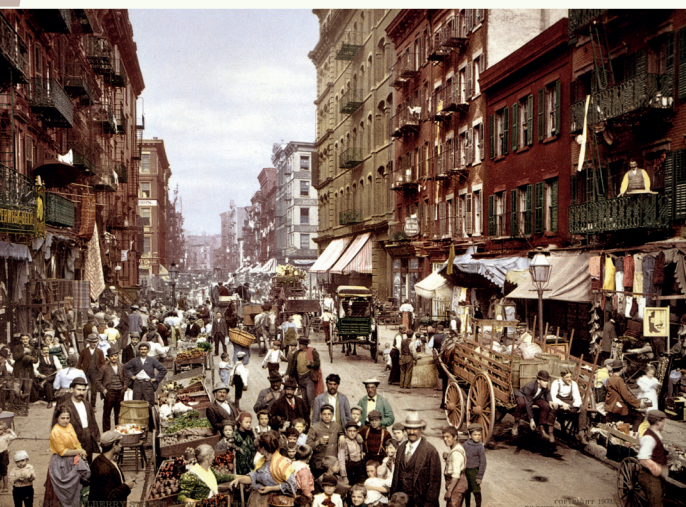
Mulberry Street in Little Italy, New York, circa 1900.

For further information: www.itinerario.nl