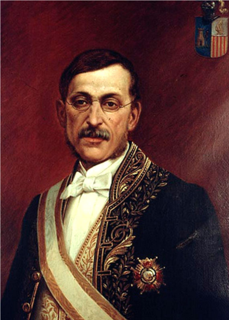
Figure 1. Portrait of Sinibald de Mas, by Tomàs Moragas i Torras, 1882.

for diplomatic relations. 19 This explains why the trafficking of Chinese workers to America had a remarkable place in consular reports in the 1850s and 1860s, whereas Mas's principal concern was signing the Sino-Spanish Treaty. After the 1864 Sino-Spanish Treaty, consuls' actions lost clarity and