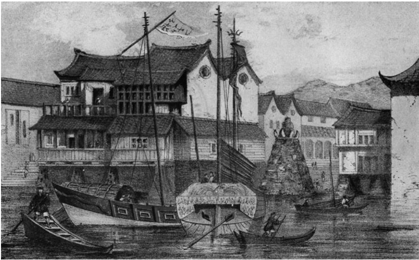
Figure 2. Many buildings at Xiamen's harbour (also known as Amoy) faced over the waterfront. "The Anchor of Amoy", W. Tyrone Power, Recollections of a Three Years' Residence in China: Including Peregrinations in Spain, Morocco, Egypt, India, Australia, and New Zealand (Bentley, 1853).

When the trade became increasingly more difficult to operate in Xiamen, the bulk of emigration turned progressively to Shantou and Macao, especially from 1857, although it continued on a small scale, at least, until 1869. This contradicts the data provided by Meagher – according to which, the trade in Xiamen had ended by 1866 – and strengthens Fix's argument that after 1866 Xiamen became "a small-scale provider of recruits in the Chinese coolie trade now based in Macao and Shantou by early 1867". 29