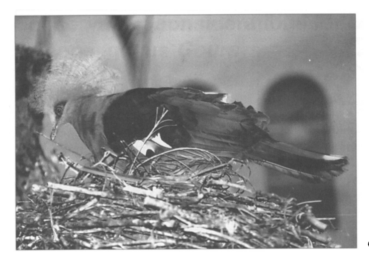
Goura cristata (Koen Brouwer).