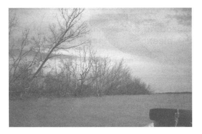
Plate 2 Former prime proboscis monkey Nasalis larvatus habitat on Pulau Kaget (November 1996, E. Meijaard ).

monkeys and the planting of some 5000 Sonneratia sp. seedlings, an important food source when fully grown. In the longer term, plans were put forward to downgrade the status of the area to a Wildlife Reserve, which would allow for other resource use besides conservation.