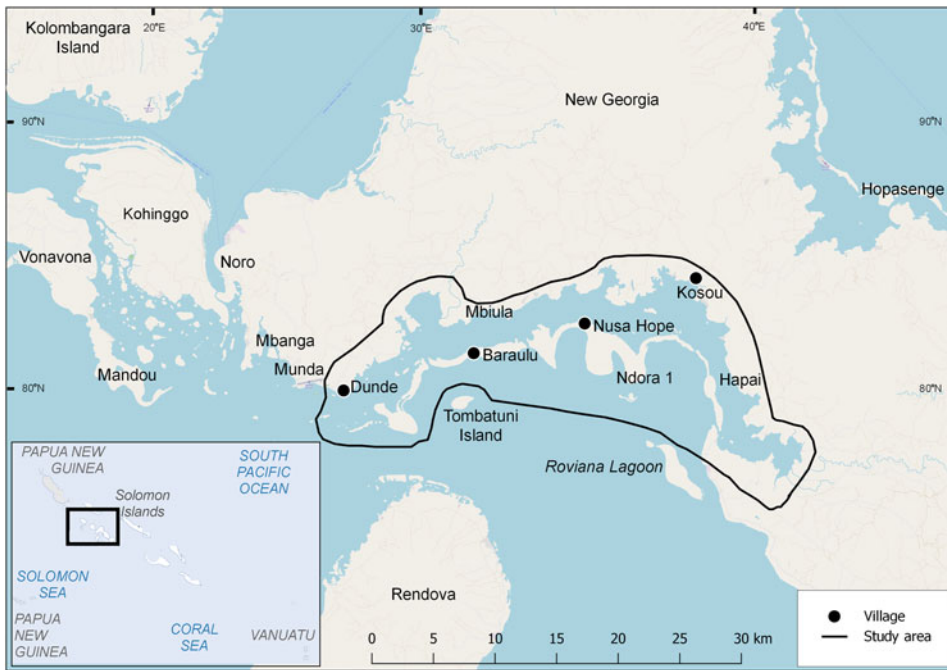
FIG. 1 Locations of the four villages (Dunde, Baraulu, Nusa Hope and Kozou) in which we interviewed residents regarding incidents with the saltwater crocodile Crocodylus porosus in the Roviana Lagoon, New Georgia Group, western Solomon Islands, during 2000–2020.

members of local clans ( butubutu ) regard crocodiles as their totemic ancestors, and may speak to them or use their presence as omens of human affairs (Aswani & Vaccaro, 2008). Negative interactions between crocodiles and people can pose a challenge to crocodile conservation (Pooley, 2015, 2016; Matanzima et al., 2023).